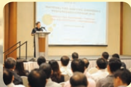
Speech by Guest of Honour - COMR Peter Lim, Commissioner SCDF